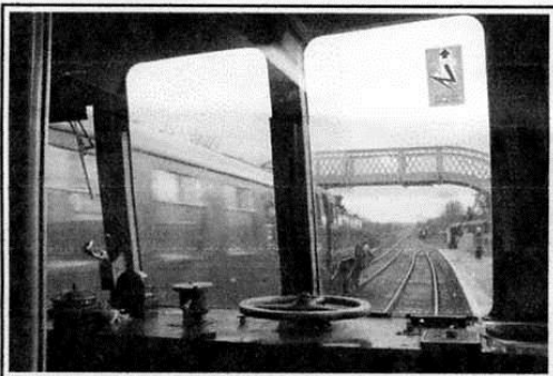
Standard 4MT Tank at Corfe Castle viewed from the rear of the DMU

Although not yet open, a footbridge has now been installed at Corfe Castle Station and it is expected to be officially opened early in the New Year.